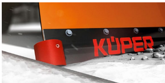
Küper curbstone deflector

A snow clearing blade accessory specifically developed for demanding requirements on the road. Durable, flexible and efficient.